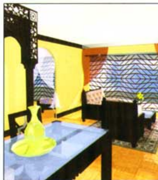
Rendering of Cinema Sindbad Interior

"The suppliers that we are working with for the Deco Contract room mock-up are: American of Martinsville, Arkansas Lamp Manufacturing,